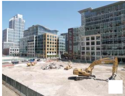
Although the Transbay Transit Center project is overseen by the Transbay Joint Powers Authority, some funding depends on revenue from Redevelopment Agency projects on state land in The City.

Redevelopment supporters have threatened to file a lawsuit if the bills pass because they contend it is a violation of voter-approved Proposition 22, which prevents the cash-strapped state from